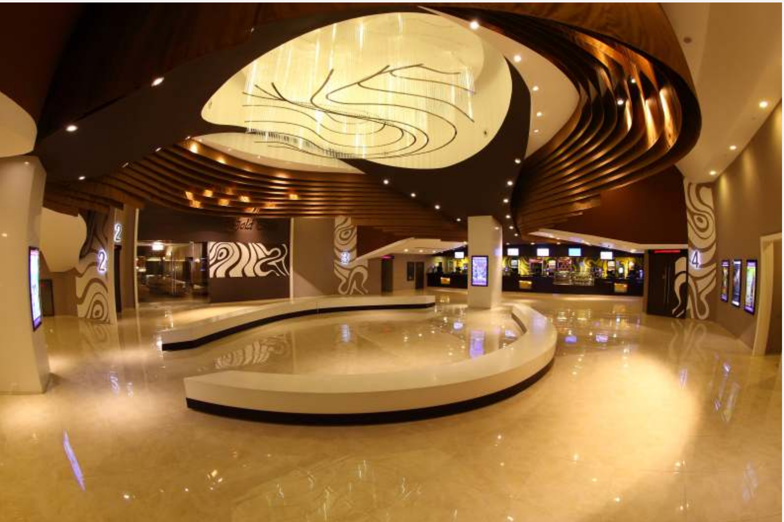
Fame Inorbit, Malad